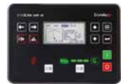
COMAP IntelliLite AMF 25